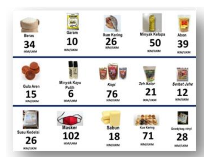
Figure 1. JP Gemilang local products in 2nd and 3rd phase

Research related to JPS scintillating and buying interest was conducted by Hartina (2021), which tested how the coordination and collaboration system in the distribution of Social Safety Net (JPS) Packages was brilliant at the beginning of the Covid-19 pandemic in the West Nusa Tenggara Province in 2020. This paper uses a qualitative research approach with a data analysis model, Miles & Huberman. The data analysis results showed that the NTB Provincial Government has carried out coordination and collaboration with multi-parties in succeeding JPS Gemilang. In addition, a study by Yuniati et al. (2020) about the impact of the Covid-19 pandemic on the purchasing power of NTB people. The study stated that people's purchasing power decreased during the Covid-19 pandemic.